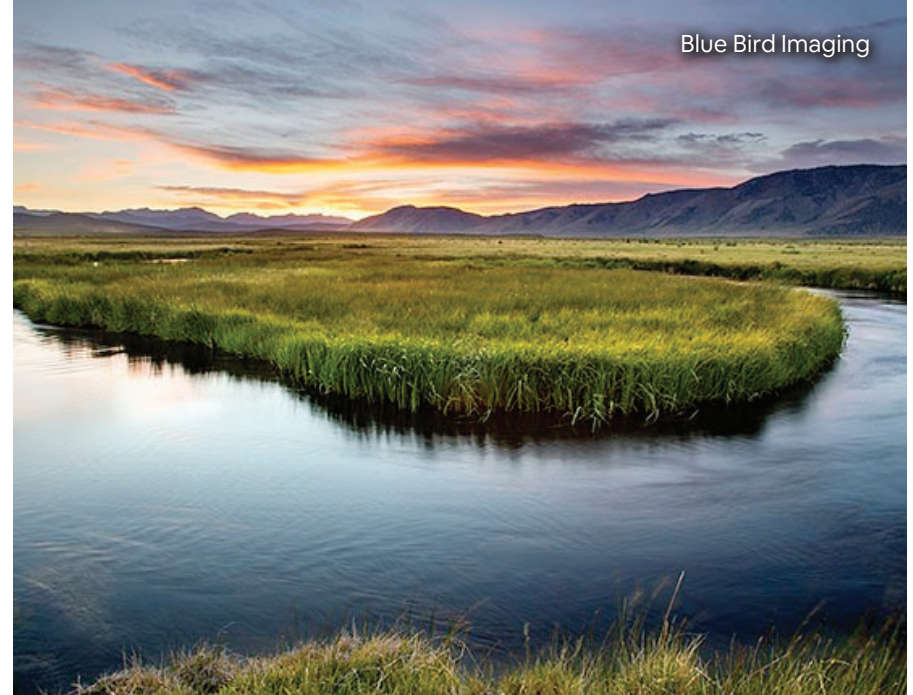
Blue Bird Imaging