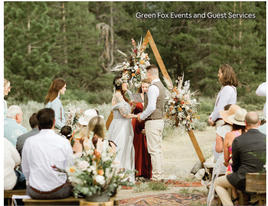
Green Fox Events and Guest Services